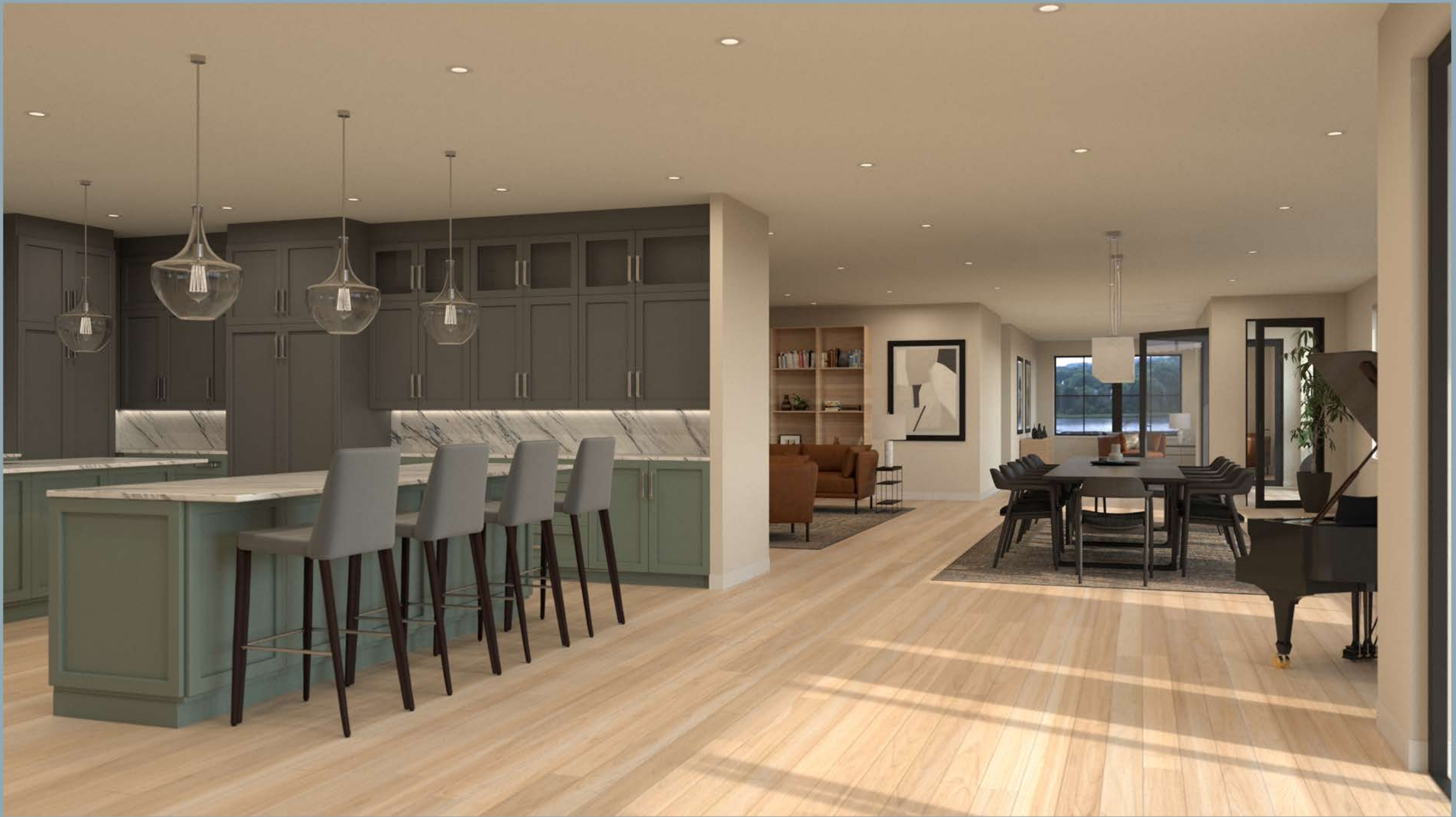
UNIT 404/406 FEATURING KITCHEN IN EVERGREEN FOG AND LAZY GRAY