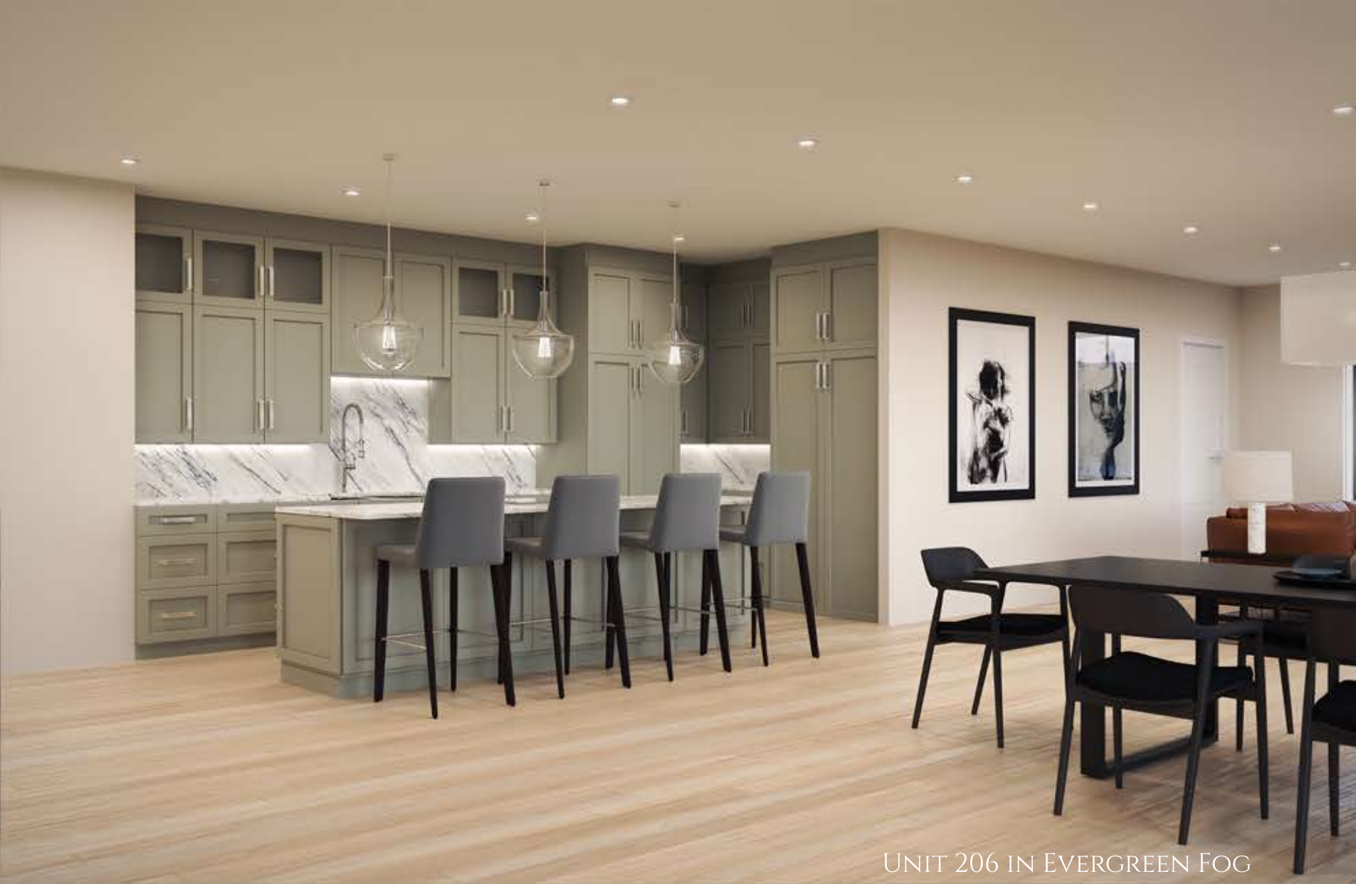
UNIT 206 IN EVERGREEN FOG UNIT 206 IN LAZY GREY