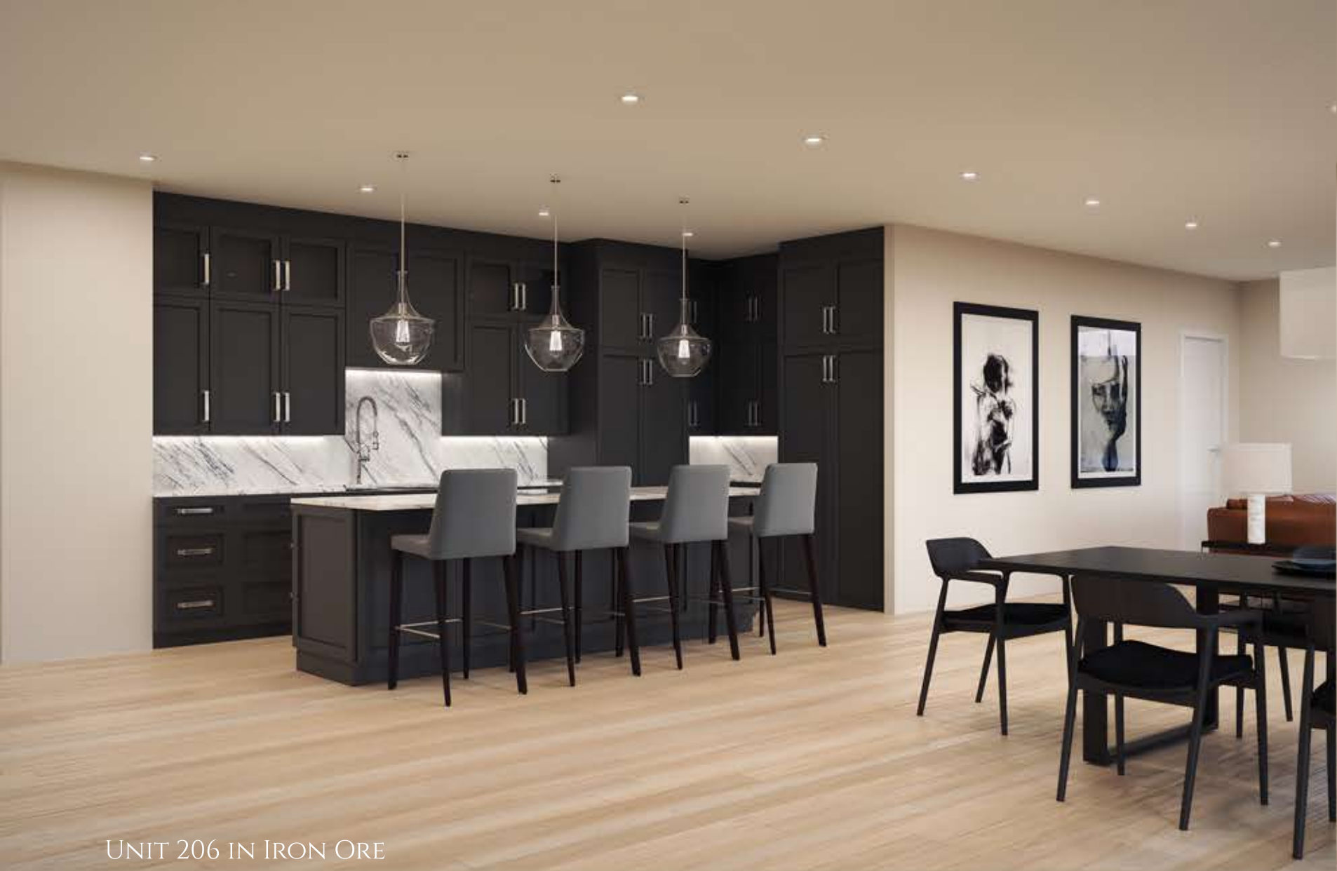
UNIT 206 IN IRON ORE UNIT 206 IN HIGH REFLECTIVE WHITE